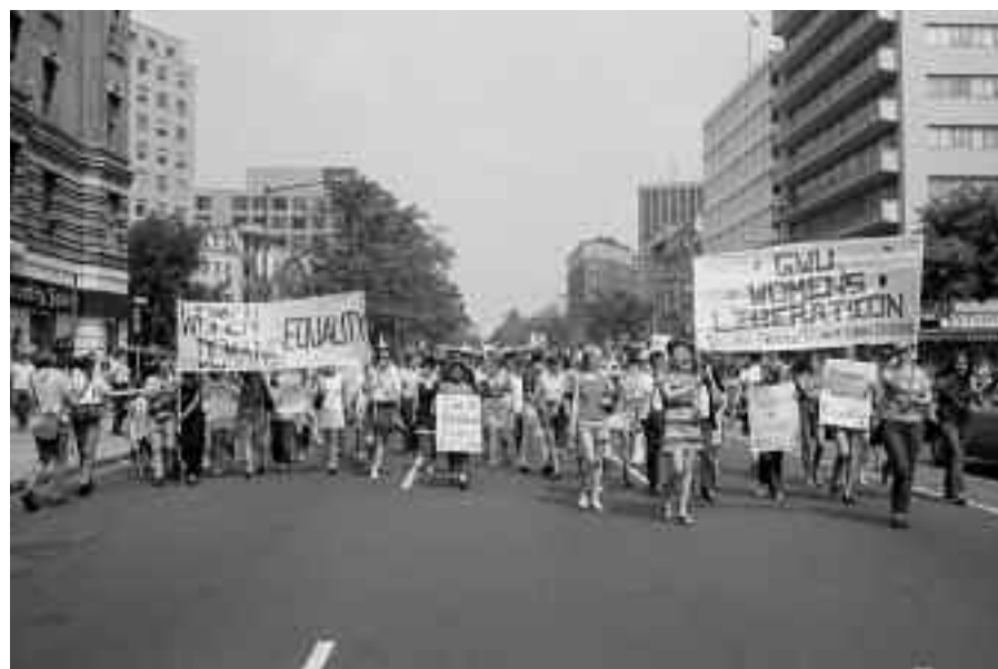
WOMEN CARRYING BANNERS AND SIGNS WHILE MARCHING DOWN A STREET IN WASHINGTON, D.C., DURING A DEMONSTRATION IN FAVOR OF EQUAL RIGHTS FOR WOMEN, 1970.

As the approach to practicing medicine shifted from general to specific, women physicians also had to adjust to changes. Gone were the days of practicing from their homes as the focus shifted to technology and the hospital setting, and while many continued as general practitioners, others moved toward specialization. Pediatrics was considered a natural extension of a woman’s skills, as were obstetrics and psychiatry. Slowly but surely over the course of the early 20 th century a small number of practicing female physicians would permeate the majority of specialized fields. Surgery, however, was one of the last fields to accept women.