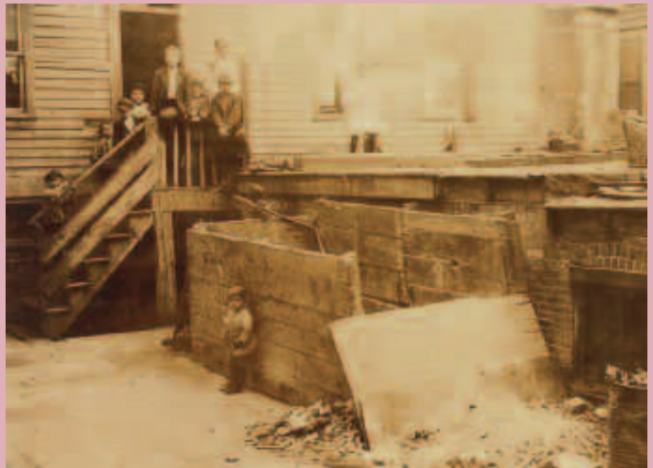
ENTRANCE TO THE CROWDED, DIRTY HOUSE OF A MIDWIFE, REAR TENEMENT ON SPRUCE STREET, PROVIDENCE, R.I.

Following the witch hunts, history is then again relatively quiet regarding midwives from the 1700s through the early 1900s—when midwives often were asked to help with the adoption of an unwanted child. Mothers paid for this service, and were able