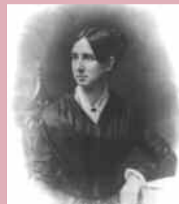
DOROTHEA DIX.

On June 10, 1861, Dorothea Lynde Dix , who had already led the effort to modernize the care of the mentally ill, was appointed to the position of Superintendent for Women Nurses by the Union’s secretary of war. Dix ran a tight ship for her nurses, stipulating that women under 30 need not apply; applicants for the service had to be plain-looking and wear simple brown or black dresses with no bows or hoops. Jewelry was also restricted. Though Dix had rules in place governing the nurses in her service, many women wanting to provide nursing care disregarded the stringent regulations and performed their work independently of the service. All told, close to 10,000 women (nearly 1,000 of them nuns) served as