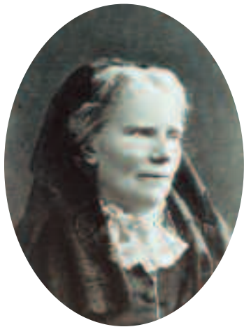
ELIZABETH BLACKWELL.