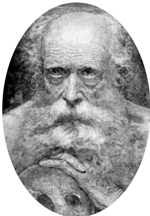
HIPPOCRATES MADE IT CLEAR IN HIS OATH THAT HEALING WAS A PROFESSION FOR MEN.

Over the past two decades, women historians have explored feminine roles in history, and often revised well-known archetypes in history. The early years of Christianity have been revisited by these scholars, and as a result, the common perception of women during this time has changed. Newer research is uncovering different perceptions of major women of the period as leaders in the Christian movement and in society. However, at some unknown point in this early history, the legitimacy of female leadership was declared heretical, and women were delegated to a position of subservience to the males then recognized as authorities.