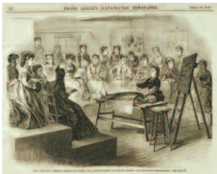
MEDICAL COLLEGE FOR WOMEN. STUDENTS IN THE ANATOMICAL LECTURE ROOM.

Additionally, opportunities for female faculty at medical schools decreased as more women were accepted into institutions that were newly co-educational. For although there may have been fewer restrictions on admissions, schools were still unwilling to add women to their faculties. On the closing