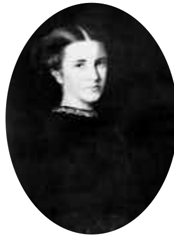
ELIZABETH GARRETT ANDERSON WAS THE FIRST ENGLISH WOMAN TO GET A MEDICAL CERTIFICATE (1865).

In early times, as man was characterized as caretaker, woman was seen as caregiver. While women practiced as healers and midwives in antiquity, early civilizations brought change to the norm. Hippocrates made it clear in his oath that healing was a profession for men, and slowly women were moved into more subordinate positions in the medical hierarchy, most prominently during the Grand Inquisition and subsequent witch trials that ensued. Despite the shift and rise of men in the field, there is evidence that women continued to practice medicine and surgery into the Renaissance, yet their numbers were severely truncated.