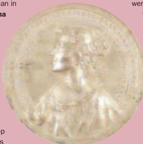
A coin was made in Laura Bassi’s honor upon her graduation.

With the occupation of Bologna by the French beginning in 1796, under Napoleon, the senate was abolished; the College of Medicine dissolved in 1798 and reforms begun by this first republic continued with the arrival of the second republic. A number of other institutions were dissolved during these regimes and researchers found themselves without jobs. The political conditions that had made it possible for some women to hold positions in institutions of higher learning were wiped out by Napoleon in 1803.