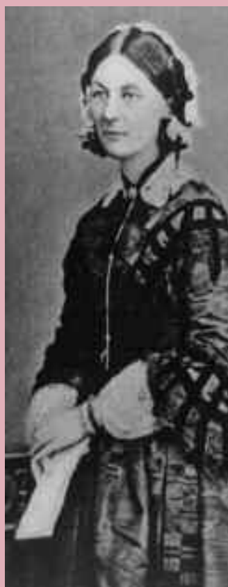
FLORENCE NIGHTINGALE.

In Crimea, the young nurse and her 38-woman nursing force found deplorable conditions—