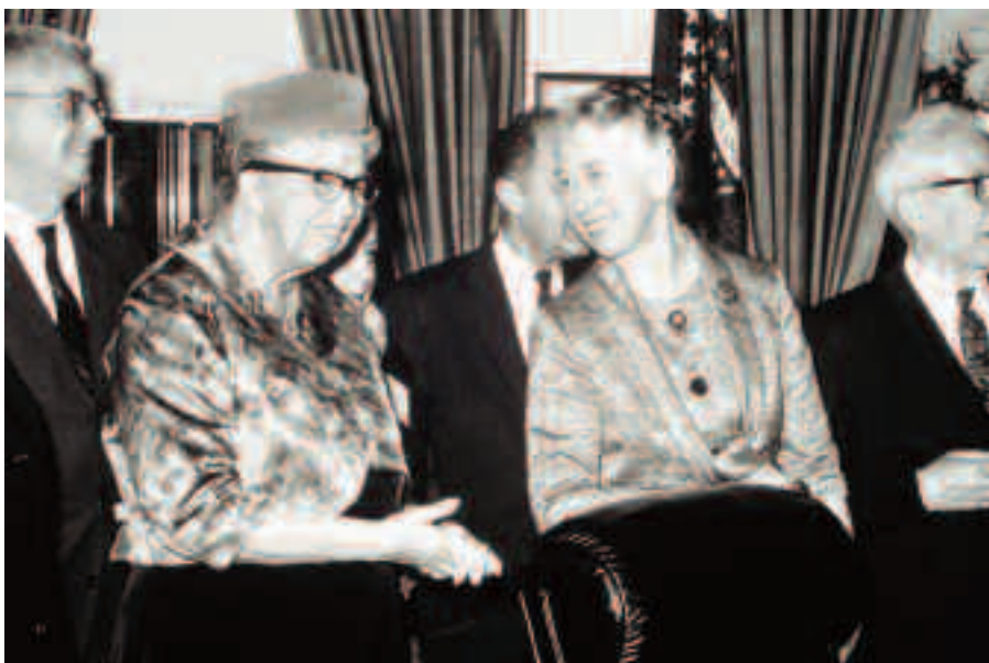
CHAIRMAN ELEANOR ROOSEVELT, PRESIDENT’S COMMISSION ON THE STATUS OF WOMEN.

The governmental emphasis on and requirement for affirmative action programs led to significant spikes in the number of female applicants to medical schools in the early 1970s. By autumn 1976, medical schools had seen a 700 percent increase since the 1959-60 academic year. During these years, an in-