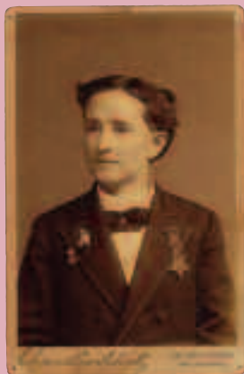
PORTRAIT OF MARY E. WALKER WEARING THE CONGRESSIONAL MEDAL OF HONOR.

Besides her unique service as a woman physician in the medical corps, Walker is also known for her propensity as a spy – frequently crossing Confederate lines to treat civilians. She was taken prisoner by the Confederate Army in 1864 and released four months later in a prisoner exchange.