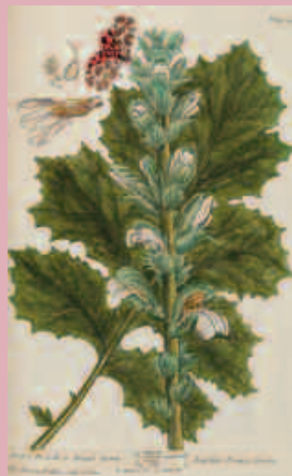
ILLUSTRATIONS FROM THE CURIOUS HERBAL .

first to use herbal tinctures, alcohol extracts, to administer herbal remedies. As development continued within the Arab scientific community, this knowledge was easily re-imported back to Europe as Crusaders re-