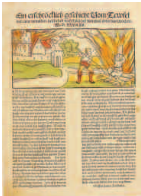
1533 ACCOUNT OF THE EXECUTION OF A WITCH CHARGED WITH BURNING THE TOWN OF SCHILTACH IN 1531.

goddesses in healing sick patients, and monasteries took a major lead in running hospitals.