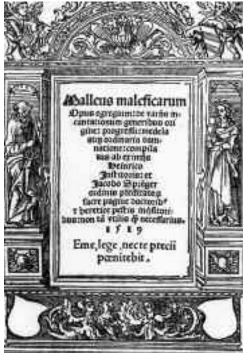
MALLEUS MALEFICARUM WAS A GUIDE TO WITCH-HUNTING. It was written during the Middle Ages. First published in Germany in 1485.

As Church influence grew and spread, herbalists—who were more accessible to and affordable for peasants and laborers than trained physicians—were gradually excluded from medical society. Saints took the place of gods and