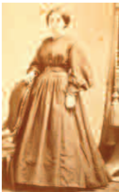
MARY PUTNAM JACOBI, M.D.

male physicians provided consultations to clinic's staff, which included many famous early female physicians, including Mary Putnam Jacobi, M.D. and Rebecca J. Cole, M.D. The dispensary was incorporated as the New York Infirmary for Women and Children.