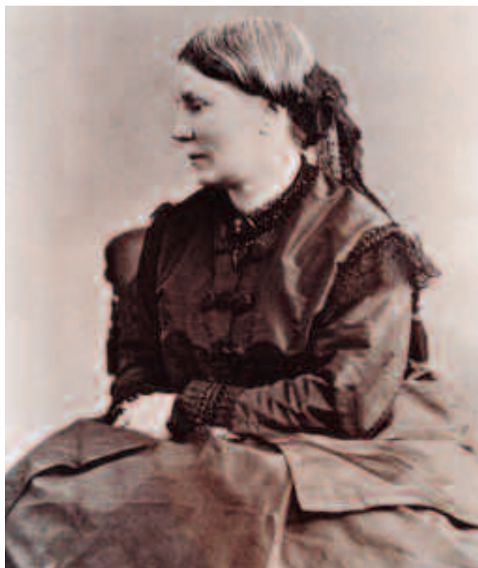
PORTRAIT OF ELIZABETH BLACKWELL SEATED IN PROFILE, 1849.

A remarkable and independent woman, Erxleben began to write her thoughts on the question of a woman’s capacity to