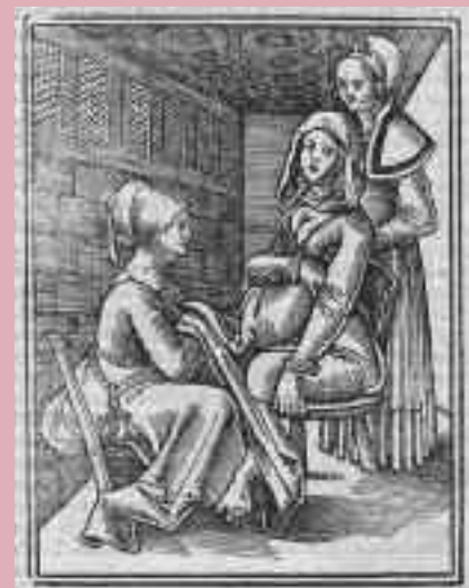
A WOMAN GIVING BIRTH ON A BIRTH CHAIR, FROM A WORK BY EUCHARIUS RÖSSLIN.

As society became more and more enamored with technology and the medical community became more specialized, fully-trained obstetricians began to replace midwives. By the mid-1900s the majority of deliveries were performed by obstetricians. However, the latter half of the 20 th century brought a rise in the number of midwife-attended deliveries and today’s expectant mother now has more options than ever when it comes to giving birth—ranging from doulas, traditional midwives and the certified nurse midwives that are found in hospitals around the world. The group even has its own professional organization independent of the American College of Obstetrics & Gynecology: the American College of Nurse-Midwives, incorporated in 1955. Today’s midwives are fully-trained, competent and play an important role in delivering the next generation.