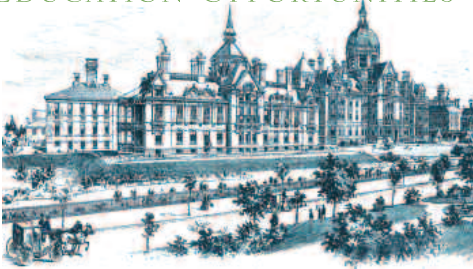
JOHNS HOPKINS BUILDING FROM HARPER'S, 1888.