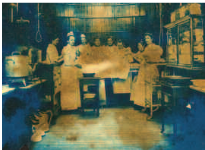
MEDICAL COLLEGE FOR WOMEN. Archives and Special Collections on Women in Medicine and Homeopathy, Drexel University College of Medicine.

of the Woman's Medical College of Pennsylvania, Dr. Emily Blackwell pointed out that the careers of female professors would come to an end. Tuition costs also rose, making it difficult for women without means to obtain the necessary education to practice the craft.