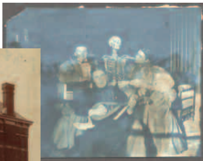
MEDICAL COLLEGE FOR WOMEN.

Women physicians at the time opted for "whole-body" fields such as pediatrics, general practice and psychiatry, along with public health and social work as they forged onward to establish themselves as publicly accepted practitioners. Their struggles were solitary and victories few until the resurgence of feminism in the 1960s.