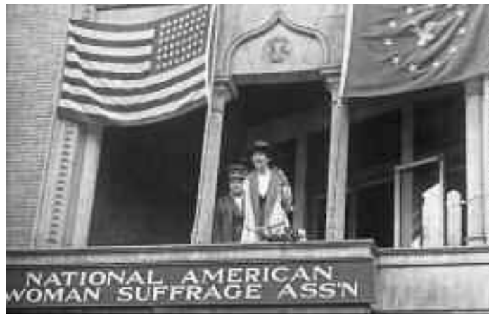
JEANNETTE RANKIN SPEAKING FROM THE BALCONY OF THE NATIONAL AMERICAN WOMAN SUFFRAGE ASSOCIATION BUILDING, WASHINGTON, D.C. CIRCA 1917.