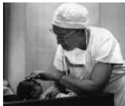
VIRGINIA APGAR EXAMING AN INFANT.

Virginia Apgar publicly regretted giving up a career in surgery, despite her undisputed success in the anesthesia and public health arenas.