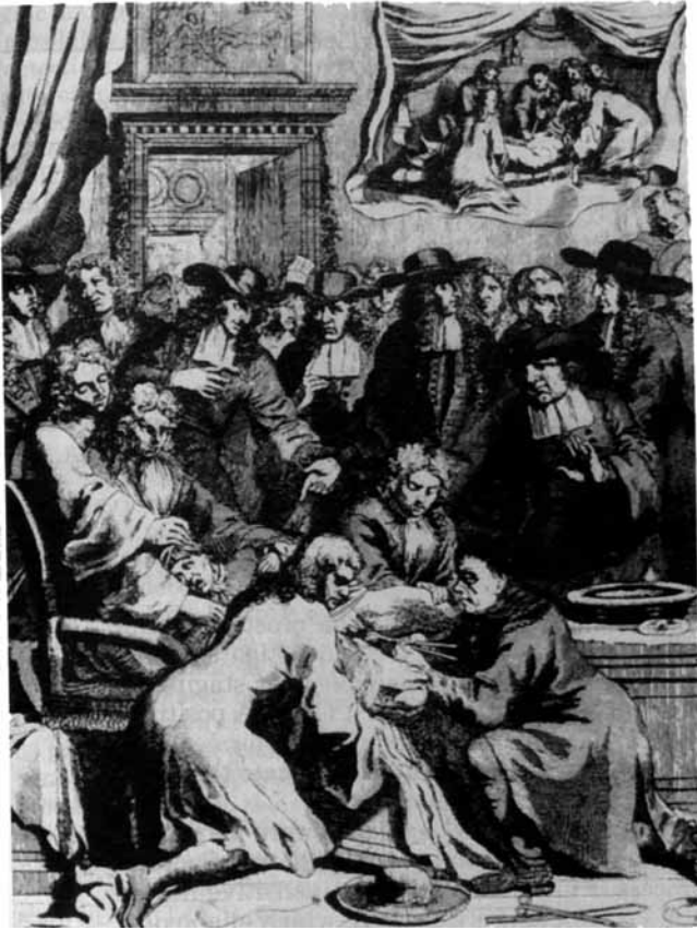
FIG. 3. Frère Jacques performing lithotomy for large group of observers. Reprinted with permission. 7

In 1702 he was invited back to Paris and his surgical results were somewhat better because he used a grooved urethral sound during lithotomy. While in Paris he studied under the famous anatomist J.-G. Duverney, who helped him with the anatomical relationships pertinent to lithotomy. However, Beaulieu was embarrassed when he was not asked to operate on Fagon, the physician and close friend of Louis XIV. de Lorges, the primary surgeon of Louis XIV, successfully performed lithotomy on Fagon. Humiliated and demoralized, Frère Jacques left Paris for a second time and traveled to Holland, where he taught Rau (1668 to 1719), the most famous lithotomist in Holland, the lateral approach to perineal lithotomy. Frère Jacques was successful in Holland, and was presented a golden set of urethral sounds and a gold medal inscribed "Pro Servatis Civibus." 3