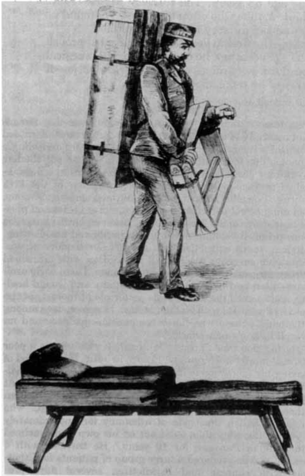
FIG. 1. Portable lithotomy table often used by itinerant lithotomists. 12

the inferior bladder neck, and a finger in the anus pressed the stone into the bladder neck. An incision was made in the left side of the perineum, lateral to the anus and medial to the ischial tuberosity, and then a diagonal incision was made to the level of the urethral sound until the bladder was entered. Therefore, the incision was made between the ischiocavernosus and bulbocavernosus muscles through the ischiorectal fossa. When the bladder was entered Frère Jacques extended the incision in both directions and removed the stone with his hands or grasping apparatus. He then often declared, "I have cut the stone out of him. God will now heal him!" Frère Jacques did not use dressings and left postoperative treatment to the family of the patient. He rarely if ever saw his patient after the procedure and was often criticized for this neglect. 10