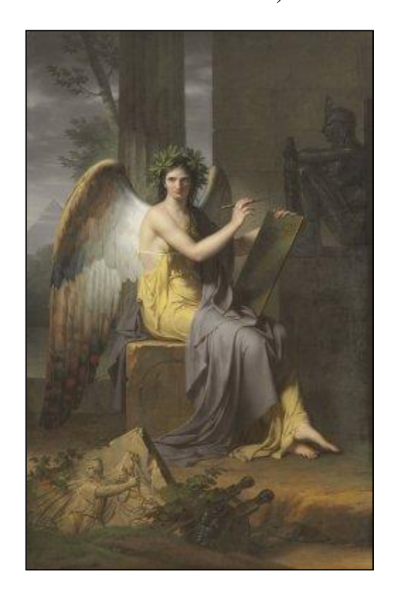
Figure 1. {\it Clio} , {\it Muse of History} (1800) by Charles Meynier.